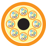
48-fibers (8 tubes of 6-fibers)