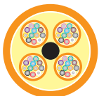
48-fibers (4 tubes of 12-fibers)